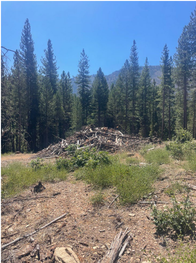
Fig 1.= Slash Pile