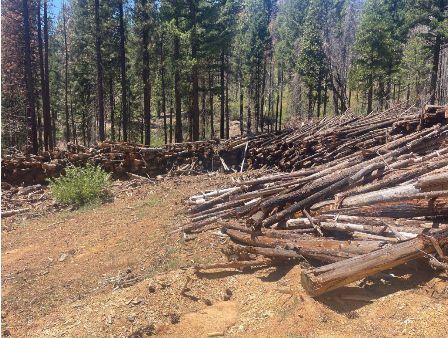
Fig 2. Decked tops