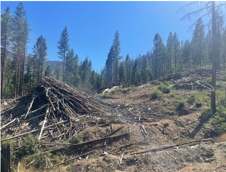
Fig 3. Slash piles (front left), Log Decks (back right)